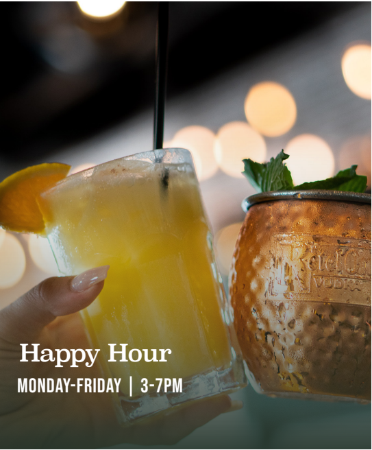
Happy Hour MONDAY-FRIDAY | 3-7PM