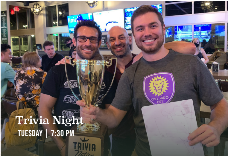
Trivia Night TUESDAY | 7:30 PM

IRISH 31 IS NOW FRANCHISING! LEARN MORE AT OWNANIRISH31.COM