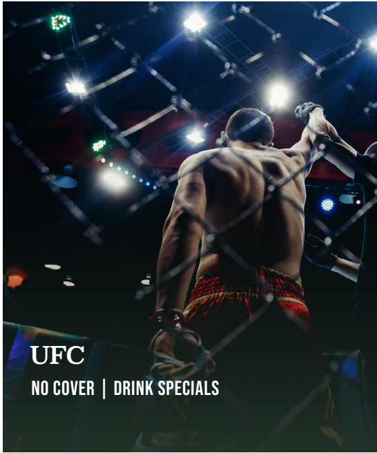
UFC NO COVER | DRINK SPECIALS