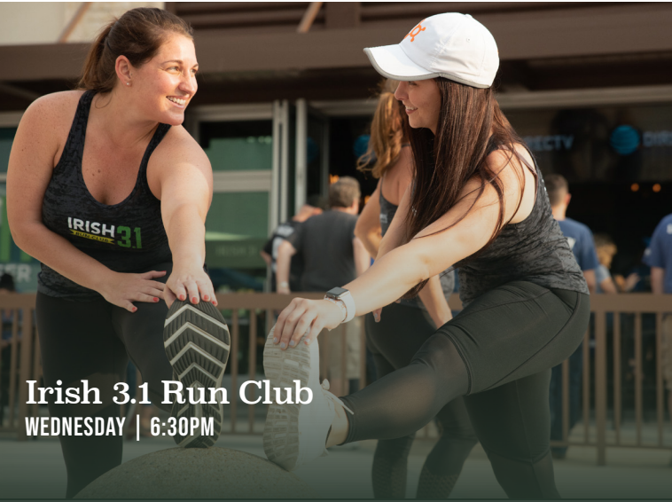
Irish 3.1 Run Club WEDNESDAY | 6:30PM